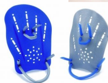
Left—Kiefer Ergo Paddles—Perfect size and shape (and cost) for paddles.