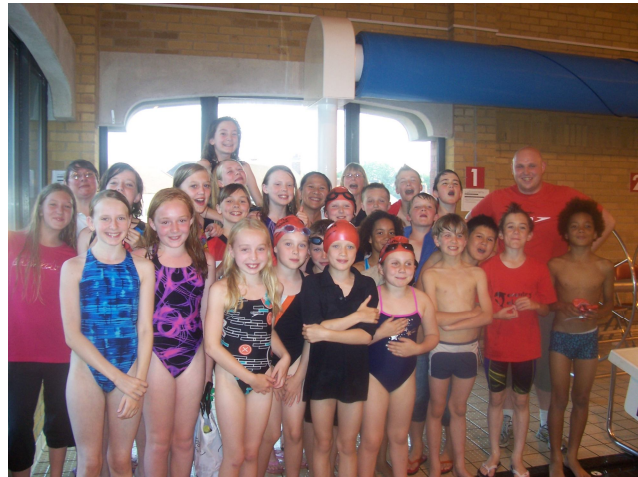
Swimmers at the end of the 3rd round at Hinckley

For our swimmers the midland regional events are the next of competition for our developing swimmers to achieve, and as with counties, I hope that we can take more swimmers to the competitions next year, and again in more events.